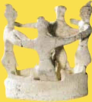
Minoan statuette showing circular dance